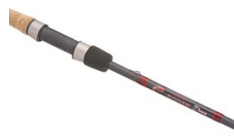
2019 Zbone - Spinning Hook Hanger.jpg