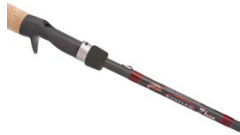
2019 Zbone - Casting Hook Hanger.jpg