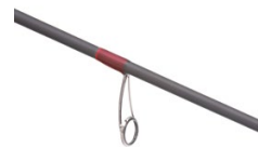
2019 Zbone - Spinning Guide.jpg