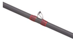
2019 Zbone - Casting Guide.jpg