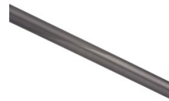
2019 Zbone - Blank closeup1.jpg