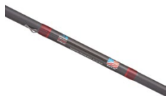
2019 Zbone Label_BK.jpg