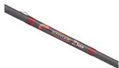
2019 Zbone Label_FR.jpg