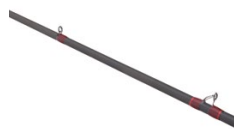
2019 Zbone - Guide System.jpg